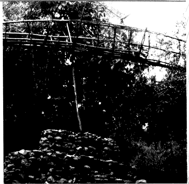
Peace bridge, Enga.

A fatalistic "don't care" attitude seems to be present in many cases. Church groups are trying to confront this, but there is still