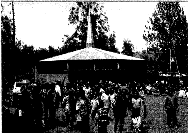
Before and after... Catholic Church Pina alive in 2006