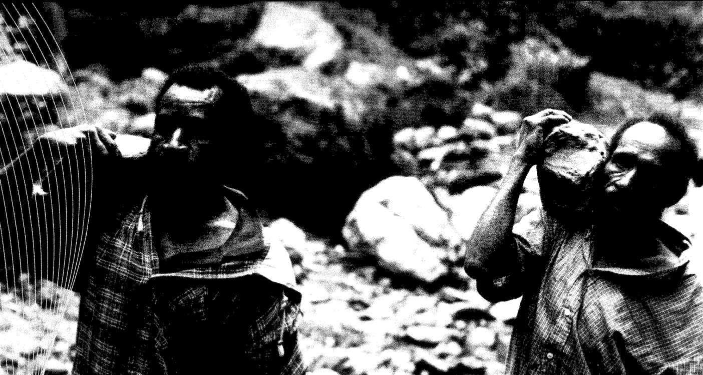
Carrying rocks for peace bridge, Enga.

In Simbu, Catholics sprinkled holy water on a battlefield.