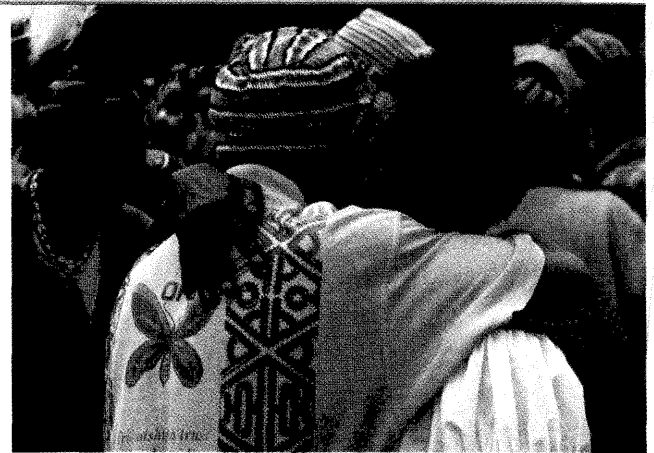
.... and in Enga.