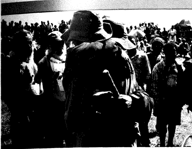
Reconciliation at peace ceremonies in the Eastern Highlands