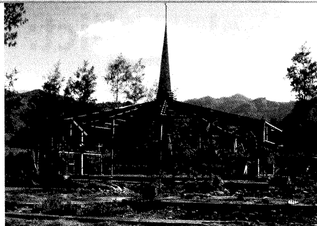
... and after fighting in 2007. Both sides of the conflict suffered.

prayed and carried stones to build up the base of the bridge.